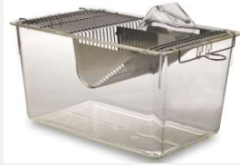
2150E 355x235x190mm – Floor Area 580cm 2