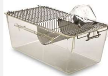
1284L Eurostandard Type II L 365x207x140mm – Floor Area 530cm 2