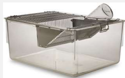
1500U Eurostandard Type IV S 480x375x210mm – Floor Area 1500cm 2