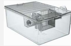
2000P 610x435x215mm – Floor Area 2065cm 2