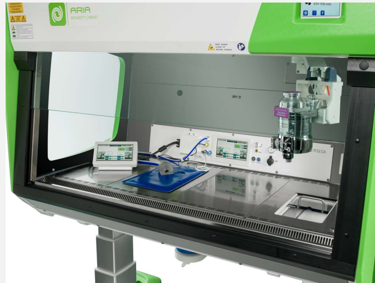
Class II Biosafety cabinet w/o Anesthesia System