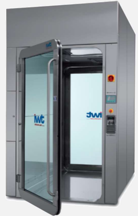
Decon Chamber H2O2