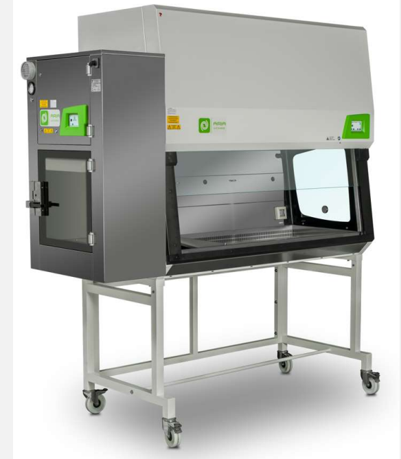
Class II Biosafety cabinet + Pass Box