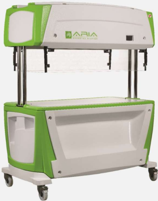
Cage Changing Station