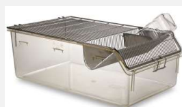
1354G Eurostandard Type IV 595x380x200mm – Floor Area 1820cm 2