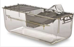
1145T 369x156x132mm – Floor Area 435cm 2