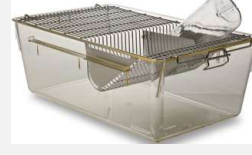
1290D Eurostandard Type III* 425x266x155mm – Floor Area 820cm 2