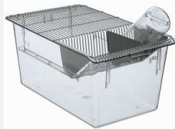
1291H Eurostandard Type III H 425x266x185mm – Floor Area 800cm 2