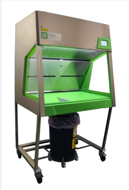
Bedding DISPOSAL station