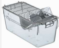
1144B 332x150x130mm – Floor Area 335cm 2