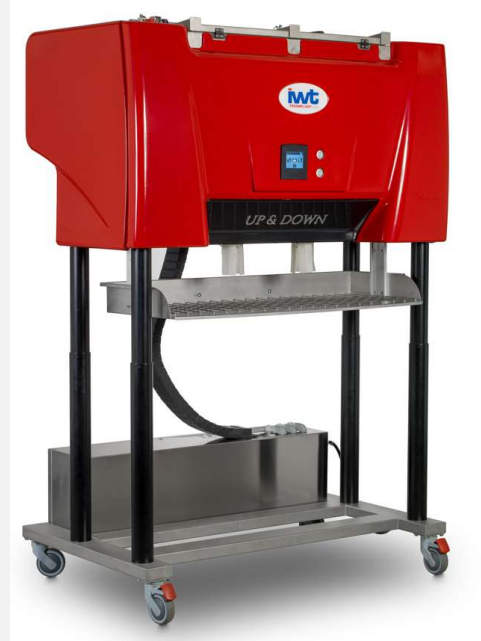
Bedding DISPENSING station