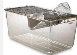
2154F 480x265x210mm – Floor Area 940cm 2