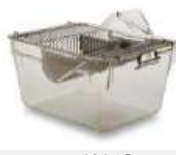
1264C Eurostandard Type II 267x207x140mm – Floor Area 370cm 2